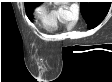
Artifact Reducing Inserts

The optional laser alignment system provides an additional point of reference directly on the breast to allow for triangulation of the treatment site. Access™ ClearVue™ is compatible with all CT scanners and treatment machines.